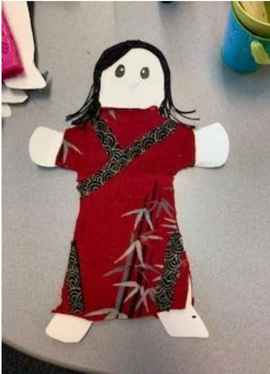
Examples of student dolls